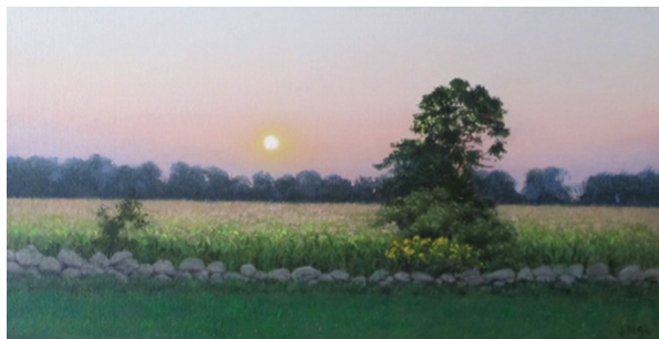
New Jersey Cornfields Oil 10" x 20"

"Most of my paintings are about light and conditions of light - light is always the real subject; a landscape, interior or still life are just the motif . Modernism and Post-Modernism leave no room for light as a subject, and that is why I make no room for these movements in my paintings. "