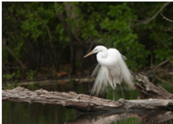
Great White Heron I Giclee on Cotton Rag 21" x 15"