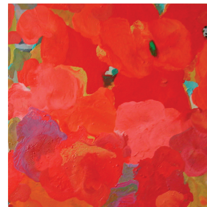
Hack, Hack, Hack II Oil, Alkyd on Panel 30" x 30"

“Nature is the art of God.” – Dante Alighieri