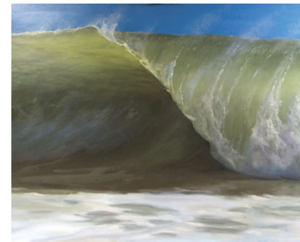
Gunnison Surg Oil on Canvas 48" x 60"

"Art is the right hand of nature." – Friedrich Schiller