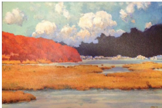
Approaching Storm Oil 24" x 36"