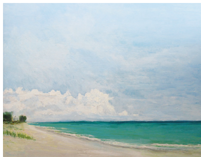
Beachfront #2 Acrylic 16" x 20"

"The subtle colors of an afternoon sunset, the strong form and body of clouds moving on the wind in an autumn sky, the soft textures in the sand on a morning beach, this is the Art in Nature which surrounds us daily every minute, every moment.