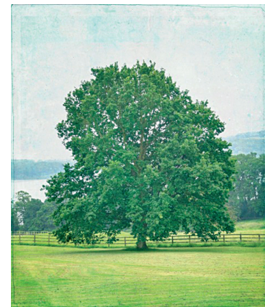
Old Oak Photography 13" x 15"

"To witness the sun rising over the Atlantic each morning, to ride my horse through the colorful woods without crossing my tracks, to walk on the beach during rain or shine and to be able to see wildlife take flight in both my yard and the parks are just a few reasons I love living in Monmouth County."