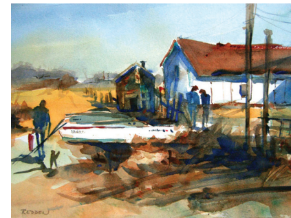
Fishermen Watercolor 18" x 22"

His work has been included in numerous gallery and museum exhibitions and has received many awards in the metropolitan area, as well as traveling exhibitions internationally. He serves as president to the historic Salmagundi Club, NY.