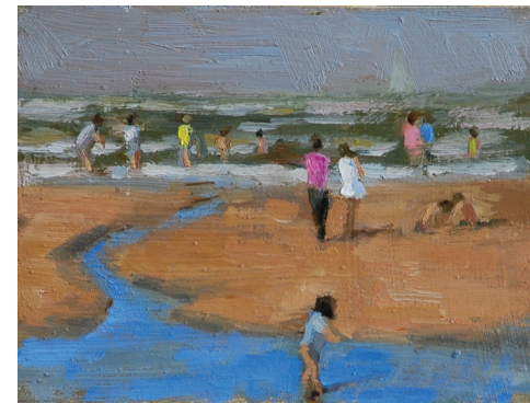
Watching the Kids Oil 6" x 8"

– Quotation engraved at the Murie Ranch, Grand Teton National Park from Wild Lone by B.B. London 1951