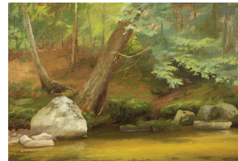
Summertime, New Hampshire Oil 8" x 12"

After graduating from college he joined what was then called the "Sotheby's Works of Art Course" in London where he worked for 6 years, followed by 3 more years at Doyle Galleries, gaining a unique perspective about painting through the auction world. The principal lesson was that painting is a language whose grammar is line and color, and if one does not gain control of this "vocabulary", one's capacity for visual expression is limited.