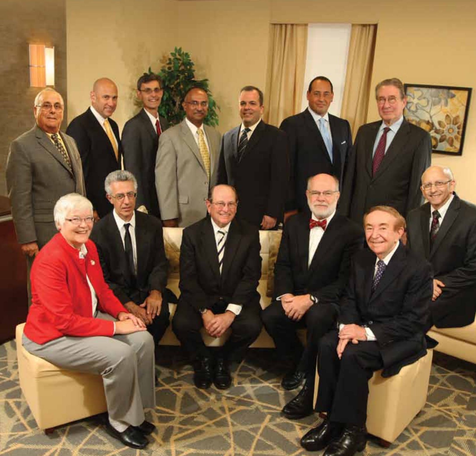
▲ Monmouth Medical Center's Department Chairs: Monmouth Medical Center Academic Departments past and present will be honored at the Crystal Ball Feature article on page 4