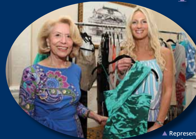
▲ Representatives from Fusion