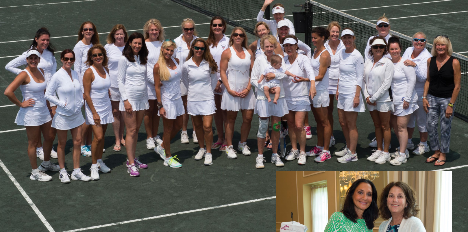
▲ Tournament players pose for a picture on the Spring Lake Bath and Tennis Club tennis courts.

The Women's Tennis Tournament was held in May at the Spring Lake Bath and Tennis Club. Proceeds from this event directly benefit the Jacqueline M. Wilentz Comprehensive Breast Center. The Ladies enjoyed a morning of tennis followed by lunch and fun chance auction. This event raised over $18,000.