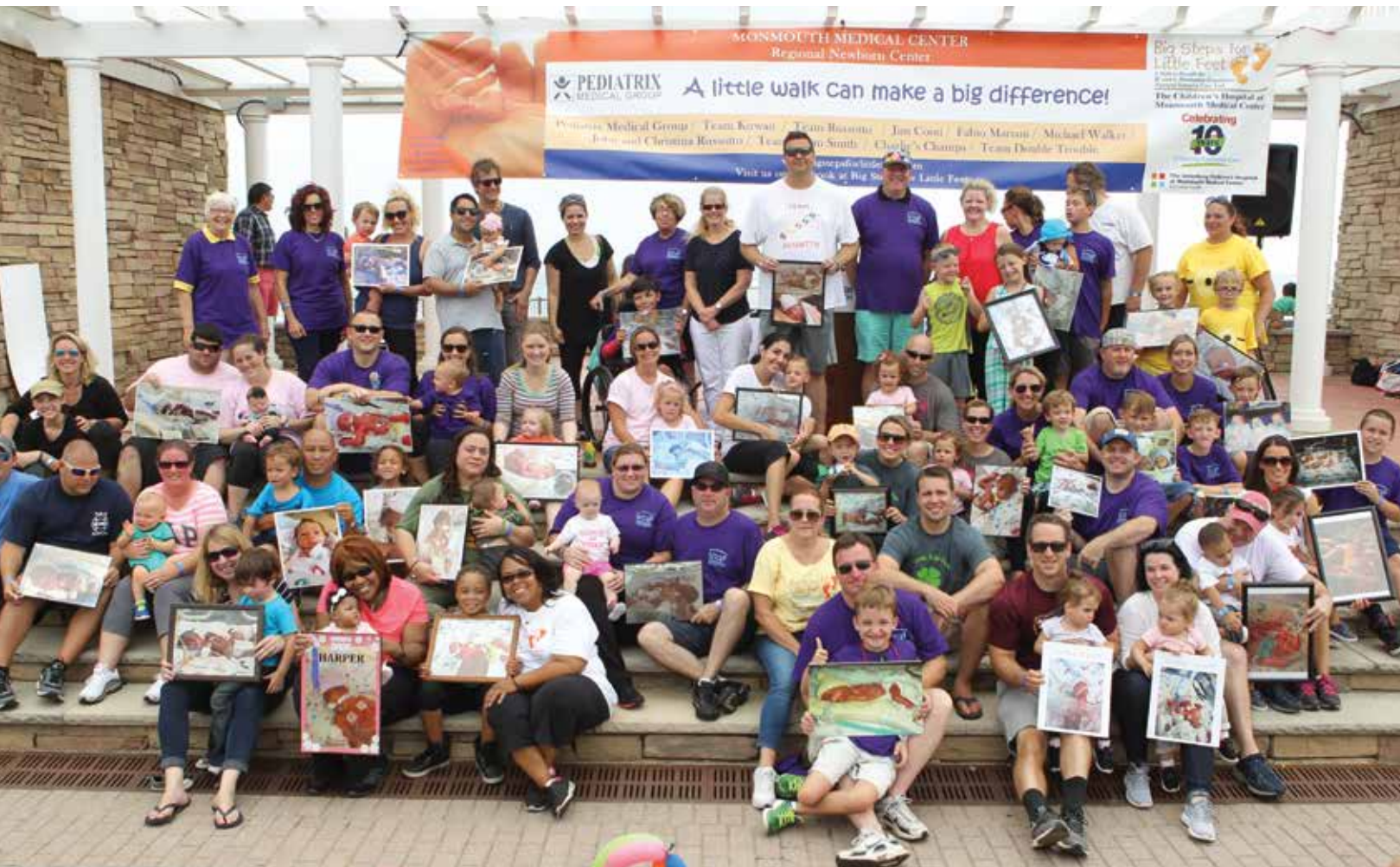
Graduates of the Hirair and Anna Hovnanian Foundation Regional Newborn Center pictured with closest friends and families.

On September 18, the 10th Annual Big Steps for Little Feet Walk raised $85,000 for the Hirair and Anna Hovnanian Foundation Regional Newborn Center at The Unterberg Children's Hospital. Graduates of the Hirair and Anna Hovnanian Foundation RNC and over 900 of their closest friends and families gathered on the Long Branch promenade for the 10th annual Big Steps for Little Feet Walk. Proceeds from the event will provide financial support for the Hirair and Anna Hovnanian Foundation RNC, which specializes in care for high-risk premature and critically ill newborns. The walk, underwritten by Pediatrix Medical Group, featured family-friendly entertainment, activities for children and refreshments.